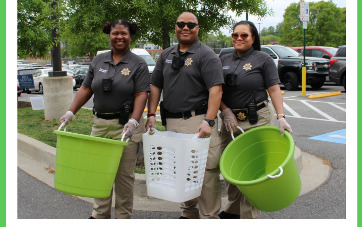
Thank you, Howard County Sheriff's Office