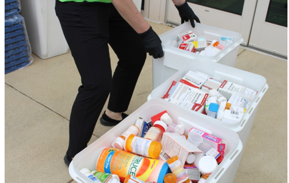
Above: Sharps in red bins (left) and medication in white bins (right)