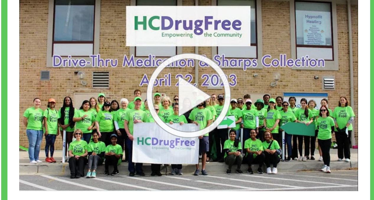
Watch Howard County Video