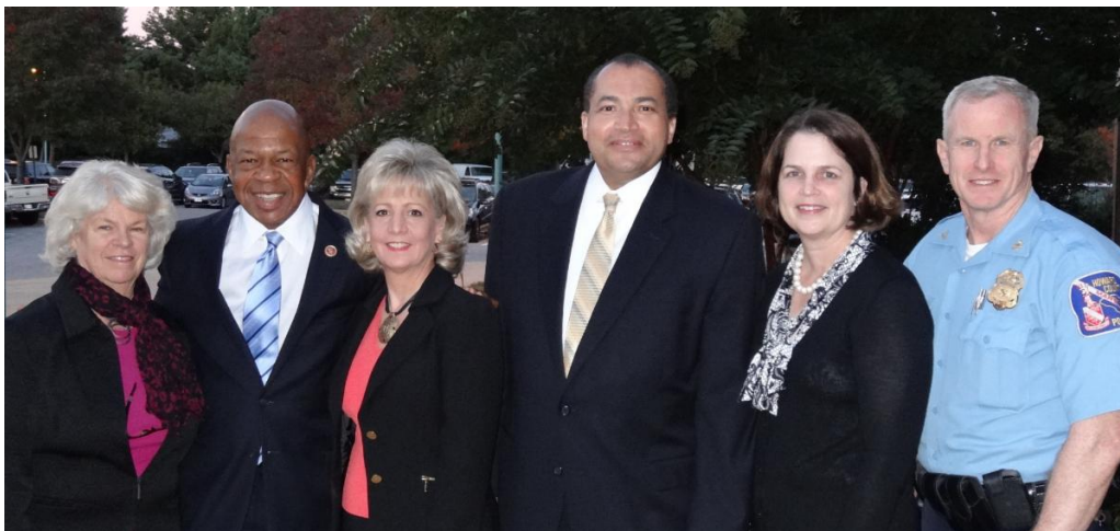
Above: HC DrugFree's Town Hall Meeting

We thank Congressman Cummings for passionately fighting for funding for drug and alcohol education, motivating many of us to speak out and work harder within our communities, and daring countless youth to dream bigger. It was thrilling to see the Congressman address thousands of students and adults from across the United States and hear the cheers and applause when he finished. His powerful words changed thinking, hearts, and lives. He will be missed, but not forgotten.