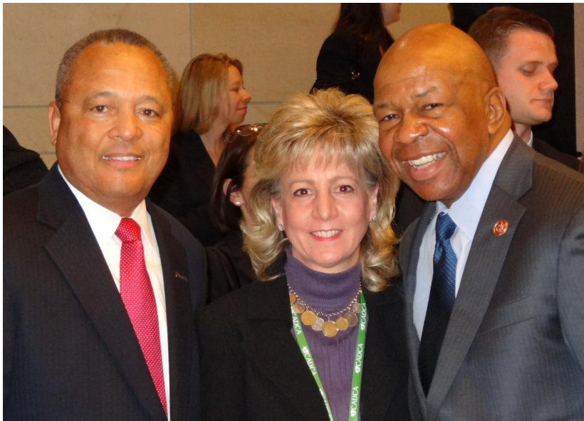
Above: In DC advocating for Drug and Alcohol Prevention/Education