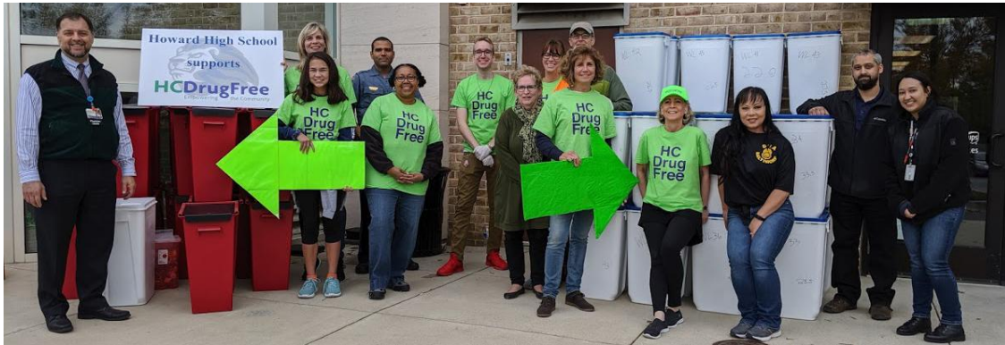
Above: White bins filled with medication and red bins filled with sharps.

Our location also collected a record-breaking amount of sharps (needles, syringes and EpiPens) -- so many sharps that we ran out of red bins.