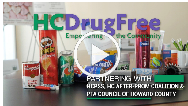
HC DrugFree Back To School 2019

Many of you asked to have another look at HC DrugFree's back-to-school video, so please click on the video below: