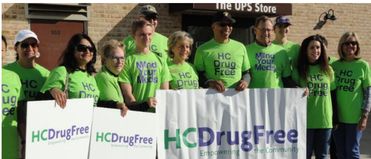
Pictured: Some of HC DrugFree's team of more than 50 volunteers

What's left in your home? Call us to walk you through how to properly dispose of your medications and sharps.