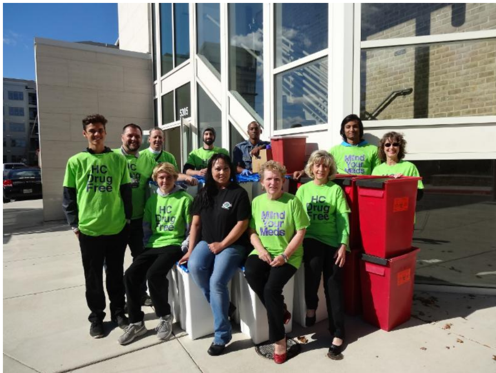
40 bins of medications and sharps collected

In total, HC DrugFree's team collected 718 pounds of medications and filled 40 large bins (27 bins of drugs and 13 bins of sharps).